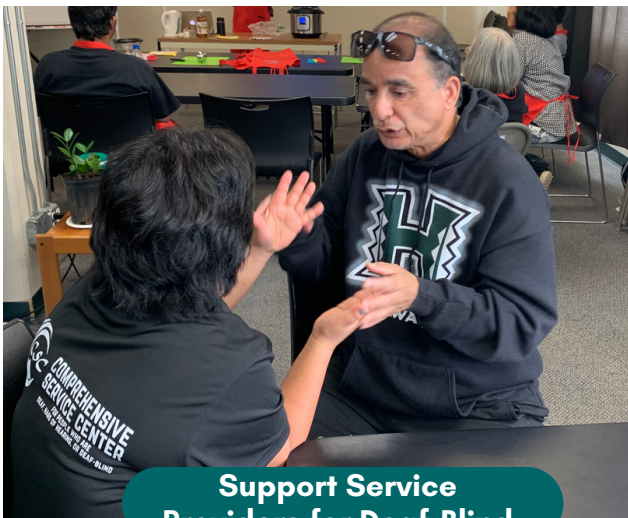
Support Service Providers for Deaf Blind